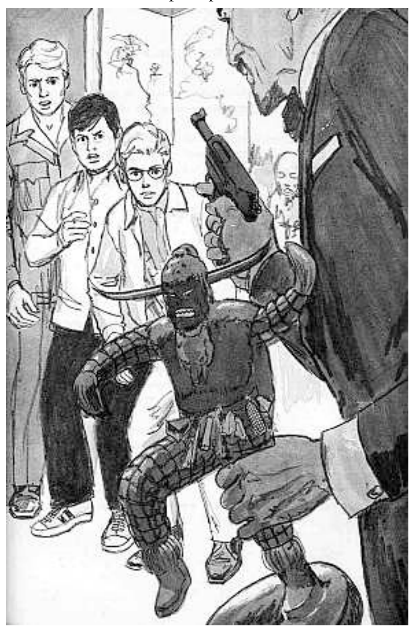
"You will all walk ahead of me to the rear of the house." They walked slowly back through the house. Wilkes flicked

your instruments on the floor." Jim, Bob and Jupiter slowly pulled out their walkie-talkies and dropped them. Bob and Jupe hastily pocketed their pencil flashlights. Jason Wilkes didn't seem to notice, or perhaps he didn't care.